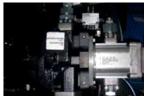
Top axial-piston hydraulic pump