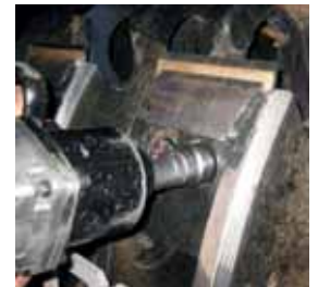
Blades easily replaceable