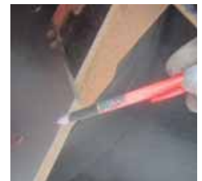
Fan wings, blower casing