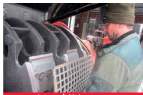
Top screen change - divided screens