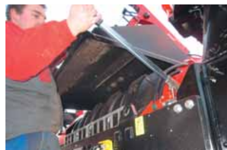
Top rotor cover - can be lifted hydraulically