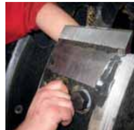
Chopping knives – extra powerful