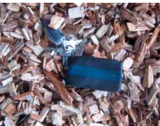
Clean wood chips - little fine particles