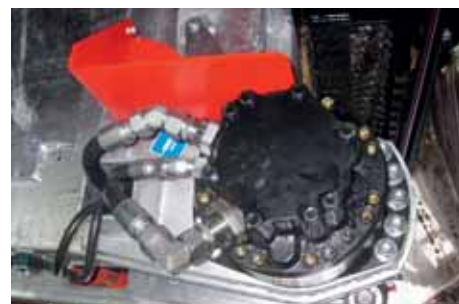
Top radial-piston hydraulic motor