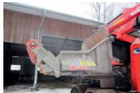
Top extension plate, foldable - feed length: 3.15 m

Other than that, this high-tech hydraulic system of the Wood-Terminator 12 is only installed in excavators etc. As a result, the new WT 12 chopper has the most powerful infeed of this performance class.