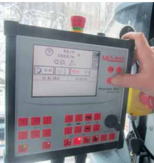
Control panel: colour display CAN bus system

The advanced, load-controlled shut-off of the infeed works miracles on tree trunks. You don't have to worry about the chopper because it processes the wood fully automatically. Consequently the operator can focus completely on crane charging and discharging. All important functions are always visible on the display. Switching the electronic chopping system, for example from soft wood to hard wood, or changing the conveyor speed can be done in only a few seconds!